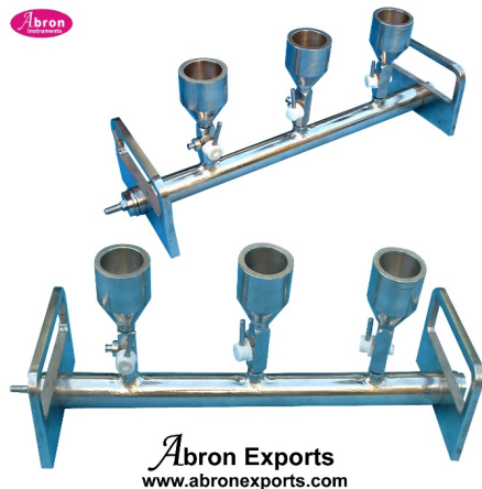
Standard Configuration of Vacuum Filtration Manifold System

Stainless steel holder with Teflon stopcock