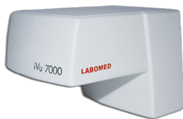
Dimensions (Units: mm)