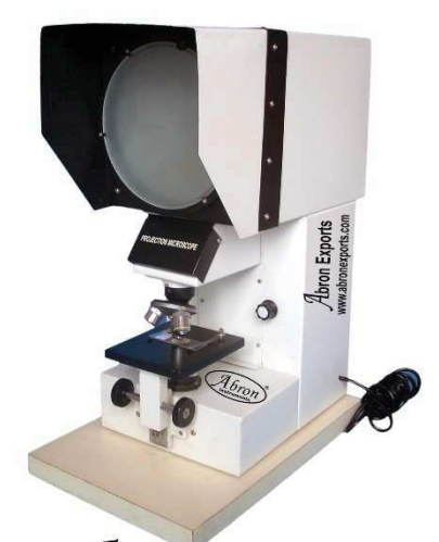
Abron Exports www.abronexports.com