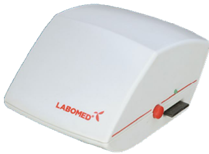
Dimensions (Units: mm)