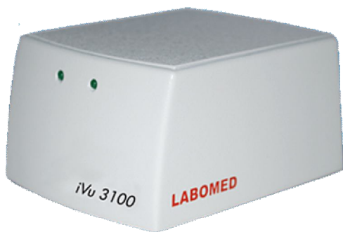
Dimensions (Units: mm)