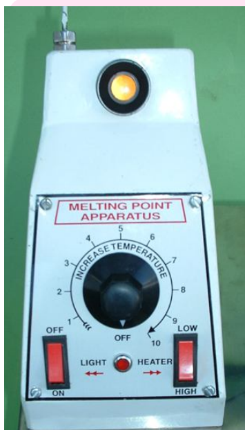
MELTING POINT AC-361