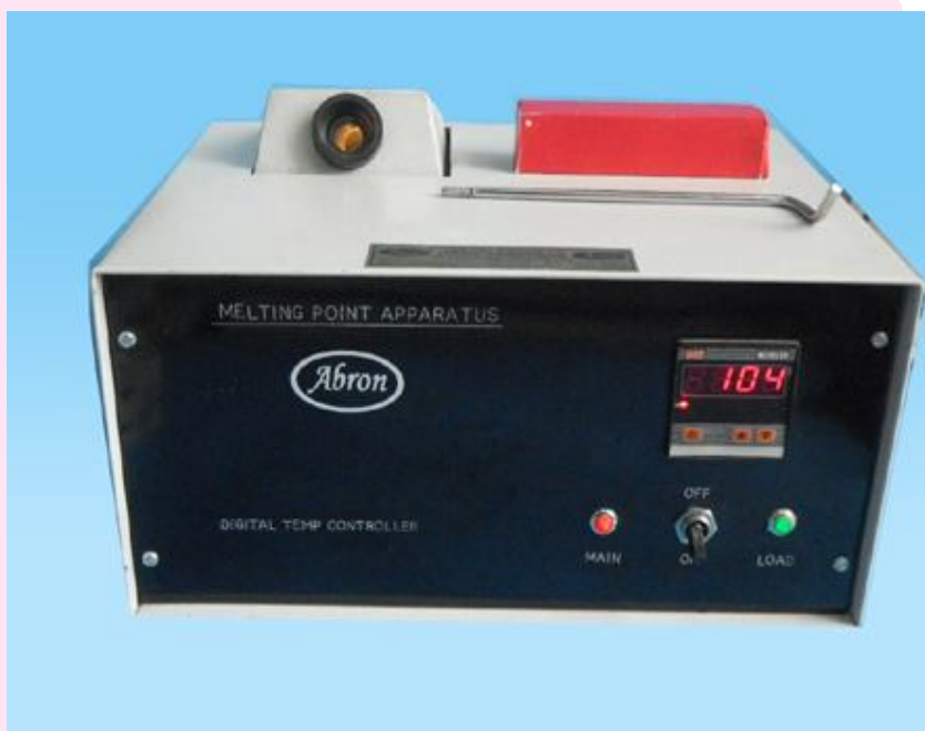
DIGITAL MODEL AC-361B